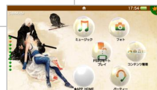
PS Vita version

Promotional video: https://youtu.be/RJs2QWGthkw